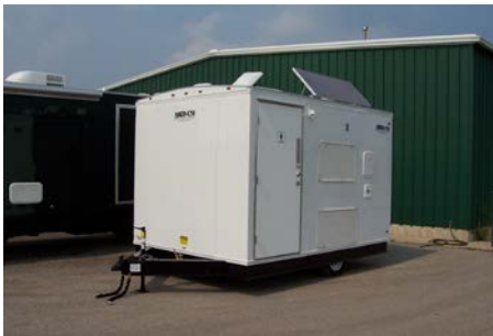
808 Oasis Kneeling ADA

All the rugged strength of our commercial trailers with a range of designer interior packages, providing a quality refined look for special events requirements. Upgraded interior packages.