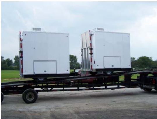
808 Traditional Kneeling ADA