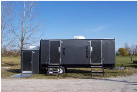
824 Royale with ADA Lift Room

Rugged, dependable, functional, and luxurious. The quality looks and materials of a fine hotel, plus the strength of an Ameri-Can engineered trailer. Individual suites with six panel oak door and coordinating wood trim and cabinetry.