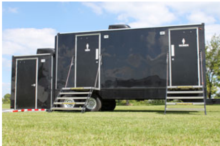
826 Royale with ADA Lift Room

Rugged, dependable, functional, and luxurious. The quality looks and materials of a fine hotel, plus the strength of an Ameri-Can engineered trailer. Individual suites with stile and rail doors and coordinating wood trim and cabinetry.