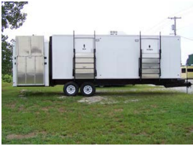
826 Traditional with ADA Lift Room

Attractive, rugged, highly functional commercial grade restrooms trailers. Designed for cost effective heavy duty use. 18 floor plans and a choice of color combinations.