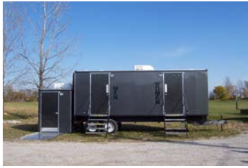
828 Traditional with ADA Lift Room

Attractive, rugged, highly functional commercial grade restrooms trailers. Designed for cost effective heavy duty use. 18 floor plans and a choice of color combinations.